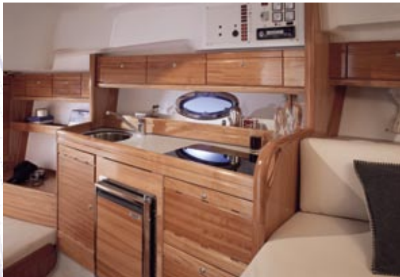
A neat and polished galley contains all the mod cons to whip up a delicious family meal.

When it comes to engineering, the Germans seldom tend to get it wrong, and it's easy to see why Wiltel is so excited about their latest addition to the South African Bavaria family. Seeing as my most lasting impression was the surprising interior, that's where we shall start. Mahogany steps lead from the cockpit straight into the galley, a neat and polished affair with a single flame cooker, refrigerator, stainless steel sink and pressurized water system, as well as plenty of storage space, all smoothed off with a standard finish of gleaming mahogany wood and veneer. A cool, cream V of bench, complete with under seat storage, curves around a mahogany table at the bow, and is surrounded by enough cubby holes to store all sorts of dining and cooking paraphernalia. This dining space converts into the main V-berth