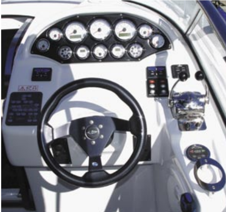
Analogue instrumentation includes a comprehensive compliment of gauges and dials.

convert it into a wide sun bed by flipping forward the back rest, but the whole thing opens up to reveal a massive storage compartment neatly separated by removable compartments. Underneath this, is an enormous ventilated engine compartment that you can literally climb into if needs be. The rest of the cockpit is comprised of a sink, with stainless steel drink holders, picnic table in GRP, a radar arch complete with stainless steel handles, safety handrails and cockpit illumination, a wet bar and drop in fridge. The deck area is clad in removable carpeting with a full wet deck beneath. In more inclement weather, the cockpit's bimini can be extended and closed completely, offering full protection from wind, rain or sea spray. If it's a beautiful day, and you don't require an awning, the entire thing can be removed.