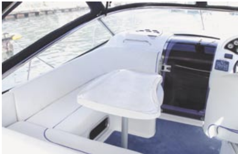
Cockpit seating is upholstered in heavy duty marine vinyl.

Moving upstairs will take you back into the self-draining cockpit, which can be separated from the interior by a tinted glass sliding door. Cockpit seating is generous and comfortably clad in heavy duty marine vinyl. The aft bench seat is quite remarkable, and a clear example of just how effective proper planning and thoughtful design can be. Not only can you