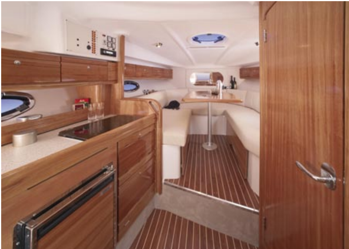
A suprisingly spacious interior is able to accommodate four adults overnight.

convert it into a wide sun bed by flipping forward the back rest, but the whole thing opens up to reveal a massive storage compartment neatly separated by removable compartments. Underneath this, is an enormous ventilated engine compartment that you can literally climb into if needs be. The rest of the cockpit is comprised of a sink, with stainless steel drink holders, picnic table in GRP, a radar arch complete with stainless steel handles, safety handrails and cockpit illumination, a wet bar and drop in fridge. The deck area is clad in removable carpeting with a full wet deck beneath. In more inclement weather, the cockpit's bimini can be extended and closed completely, offering full protection from wind, rain or sea spray. If it's a beautiful day, and you don't require an awning, the entire thing can be removed.