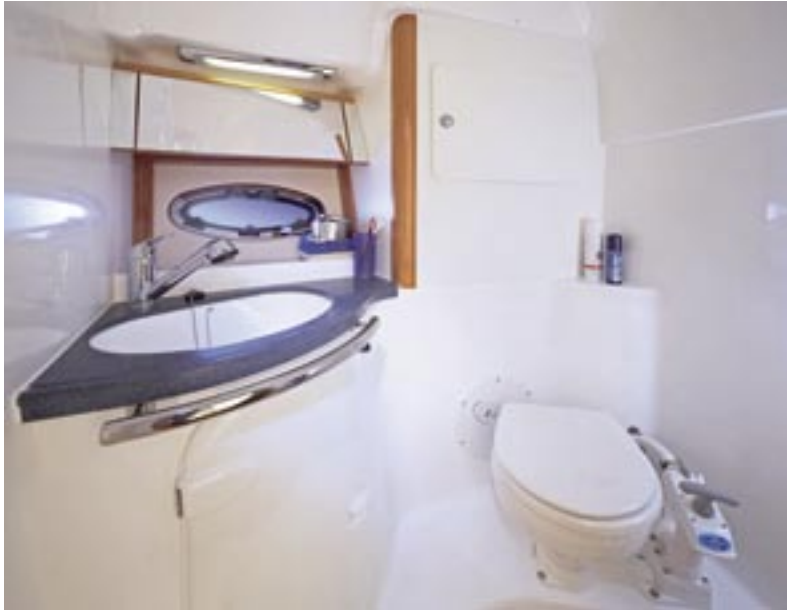
The head is totally sealed off and contains a sea toilet, washbasin and hot and cold shower.