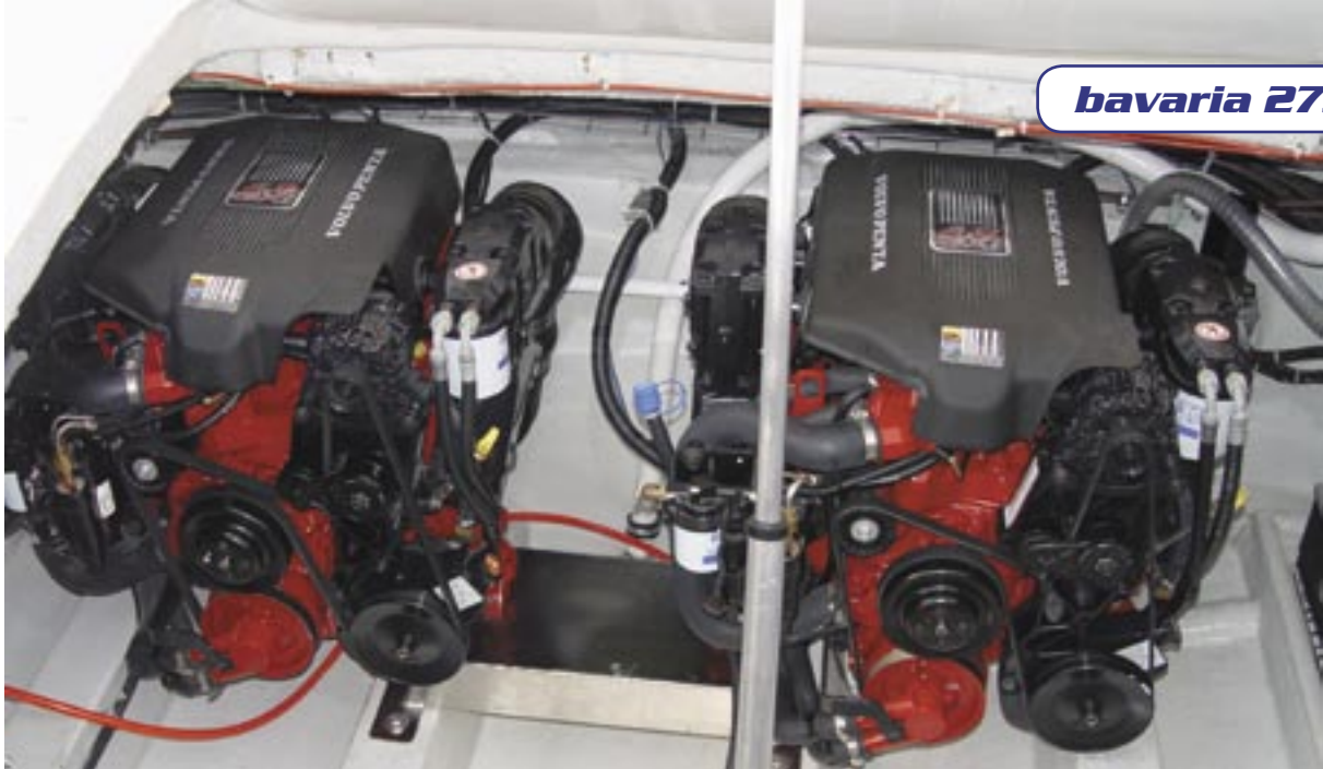
The Bavaria 27sport comes with a variety of engine options including single and twin, petrol and diesel.

The skipper mans the helm from a cushioned swivel seat and has all the necessary gadgets at his disposal to monitor the craft's every move. Analogue instrumentation includes a log, depth finder, voltmeter, rev counter, engine temperature display, hour counter, illuminated compass and gauges for fuel and oil pressure, with a carbon design steering wheel which is fully adjustable. A broad band of safety glass windscreen set into a stainless steel frame separates this area from the bow. The standard windscreen wiper will come in handy if you happen to be out in more turbulent conditions. The bow can be accessed by walkways along the sides of the craft, where you will find the anchor, anchor roller and self-draining anchor locker, as well as another entry point into the water. At the stern, a good sized teak swim platform, that I might add stayed noticeably dry during our run, offers enough room for a couple of bathers, and comes complete with a telescoping boarding ladder. There is also a hot and cold outdoor shower, a welcome relief after the chill waters of the Cape or warm, salty Indian Ocean.