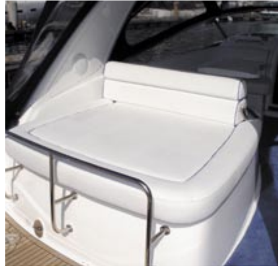
The aft sun bed opens up to reveal a huge storage compartment and a ventilated engine room.

you'll have to stoop a little while showering, but clever use of lighting and mirrors makes the space feel as airy and spacious as possible. The interior floor is mahogany, but can be replaced by carpeting if so wished.