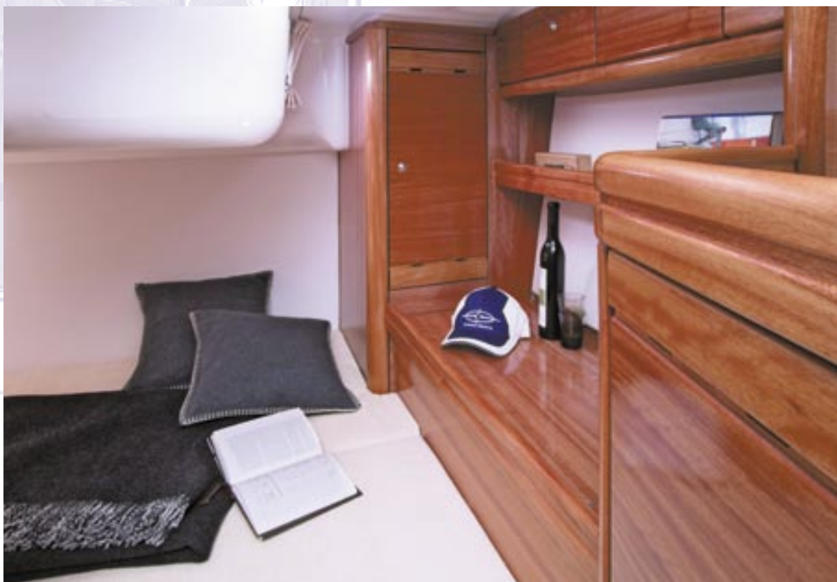
Interior storage is ample and includes two hanging lockers.

good sized, well lit head. This totally sealed off head is made up of a sea toilet with manual pump, washbasin, hot and cold shower with electrical pump, storage compartments, and a holding tank. If you are over 5'11"